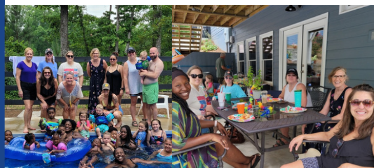
Summer fun with Mentors, Mentees, Board Members, & staff 2023