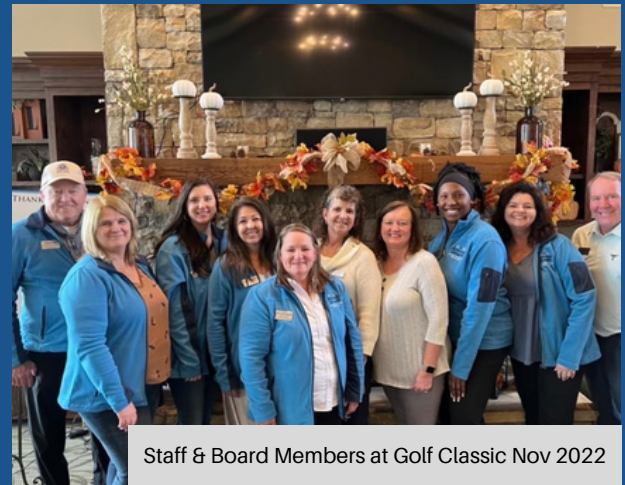
Staff & Board Members at Golf Classic Nov 2022

For the hard work, our moms put in each day to strive to make a better life for their families. GRATEFUL. Daily, I am honored to partner with a staff that works tirelessly to find resources and funding to give our moms the best chance to achieve their dreams. A Board of Directors that continuously strives to improve what we do to help our moms and reach our long-term goals. For all these things, I am GRATEFUL. You received this newsletter because of your willingness to support, encourage and participate in our mission. You have positively impacted single moms' lives by allowing them to improve their families life. For this, I am forever grateful. Most important, I am grateful to God for guiding our steps and providing for our every need.