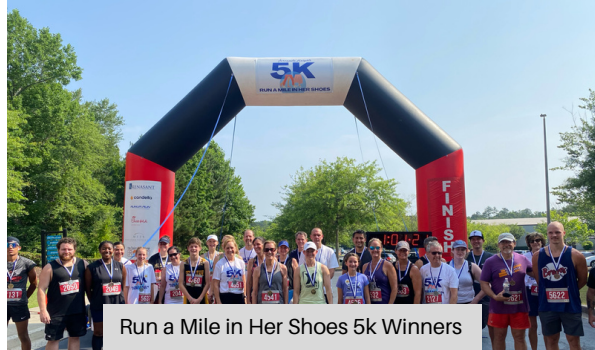
Run a Mile in Her Shoes 5k Winners